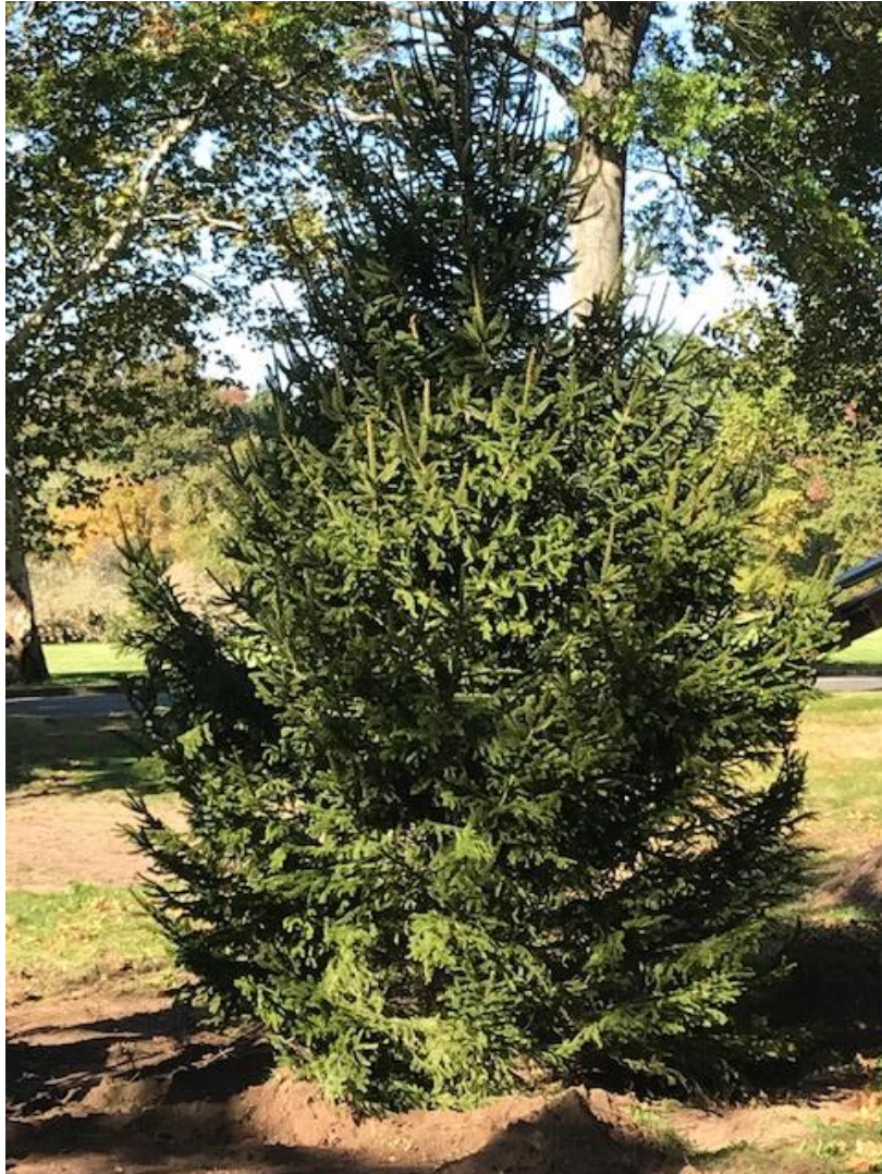
16' Norway Spruce in Branch Brook Park, near the Ballantine Gates